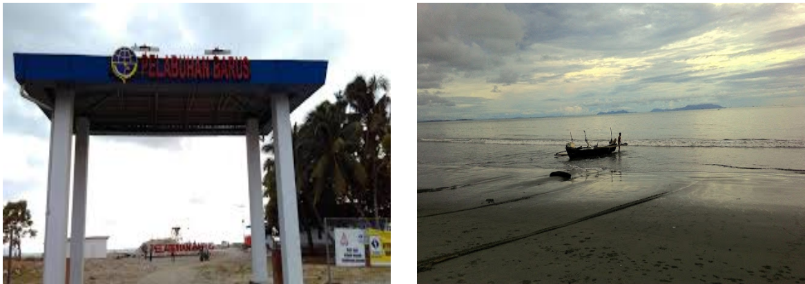
Figure 6: International Port in Barus

At present the rest of the main harbor in Barus is no longer be found as it was hit by the sea water abrasion. And it is suspected that the location of this port is close to the zero point of the Islamic Archipelago civilization. Near the place, a large port was built.