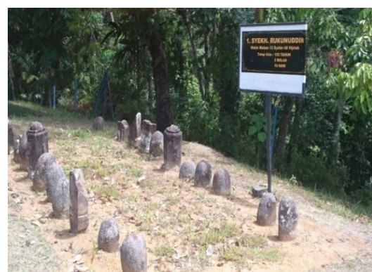
Figure 5: Mahligai's Tomb