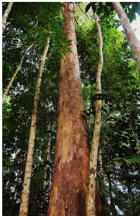
Figure 7: Chalk Tree

Camphor (camphor) whitish, translucent, dry extraction liquid Crystals from camphor trees that grow 20-60 meters of leaves are shiny and have a different odor from camphor. To get this camphor the stem must be split to get the crystals stored in the stem, and when the sap is left, it will dry up and crystallize.