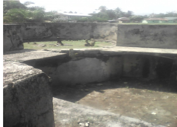
Figure 8: International Port and Portuguese Fort in Barus