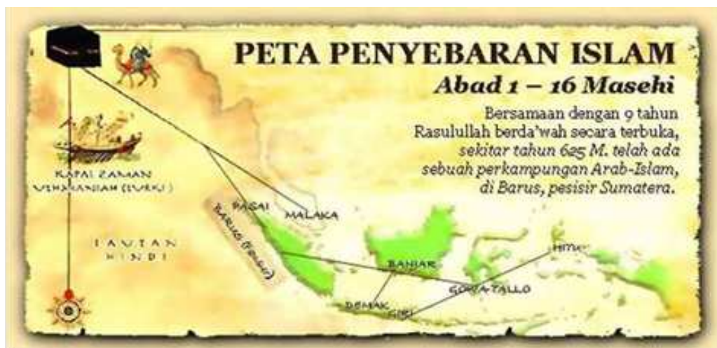
Figure 2: Map of the Spread of Islam in Barus

An ancient map made by Claudius Ptolomeus, one of the Governors of the Greek Kingdom based in Alexandria, Egypt, in the 2nd century AD, has also mentioned that on the west coast of Sumatra there is a commercial port called Barousai (Barus) which is known for producing fragrances from mothballs. In fact, it was also told that camphor made from camphor wood from the city had been brought to Egypt to be used for embalming corpses during the reign of Pharaoh since Ramses II or about 5,000 years before Christ (Kompas, April 1, 2005).