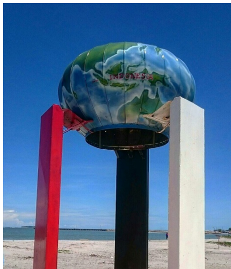
Figure 1: Point 0 (zero) Nusantara Islamic Civilization in Barus

As stated by Marwan Dasopang, Barus in the 6th century was known to have a high civilization, this was evidenced by the tomb of a saint in the "Tingi Board" which was on a hill as high as 215 m which had to pass through \pm 730 steps, on a gravestone it reads the Persian script, signifying that the tomb is not a native of Barus.