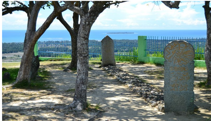
Figure 3: Graveyard Board of High Archipelago Islamic Civilization in Barus

meaning," Then everything is destroyed except the essence of Allah ". Taking from the date 44H is the era of Khulafaur Rasyidin, it is proved that Islam has reached Barus in the days of the Khulafaur Rasyidin.