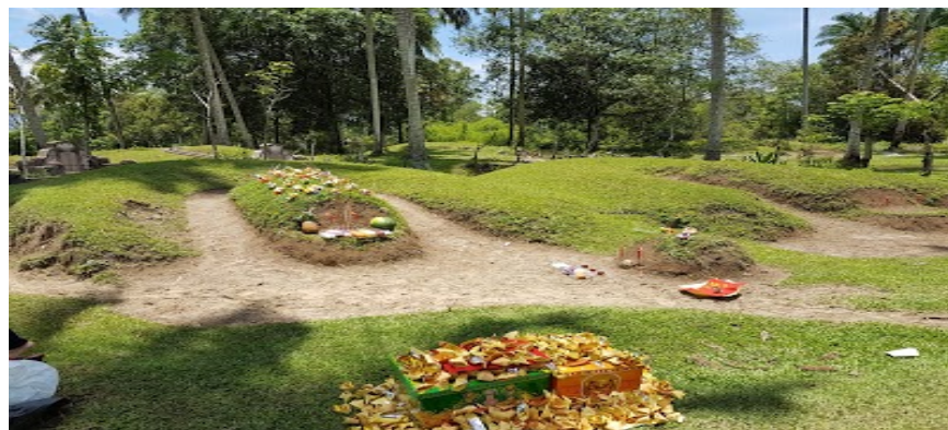
Figure 9: Chinese Burial Complex in Kinali

There is an opinion that says that the word "Barousai" in Chinese is Barus which is recorded in the history of the Liang Dynasty, the King of South China who ruled in the 6th century. He has carried out a trade expedition to Barus. and in 1995 many ceramics were found from 9th-century Guangdong (Irianti Dewi: 2006, 12). This shows that the Chinese lived in Barus with evidence of old graves located in Kinali Village.